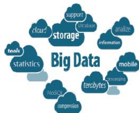
Fig 1: Big data

Fig 1 shows a typical bug data representation./ The areas for example that comes in big data are shown.